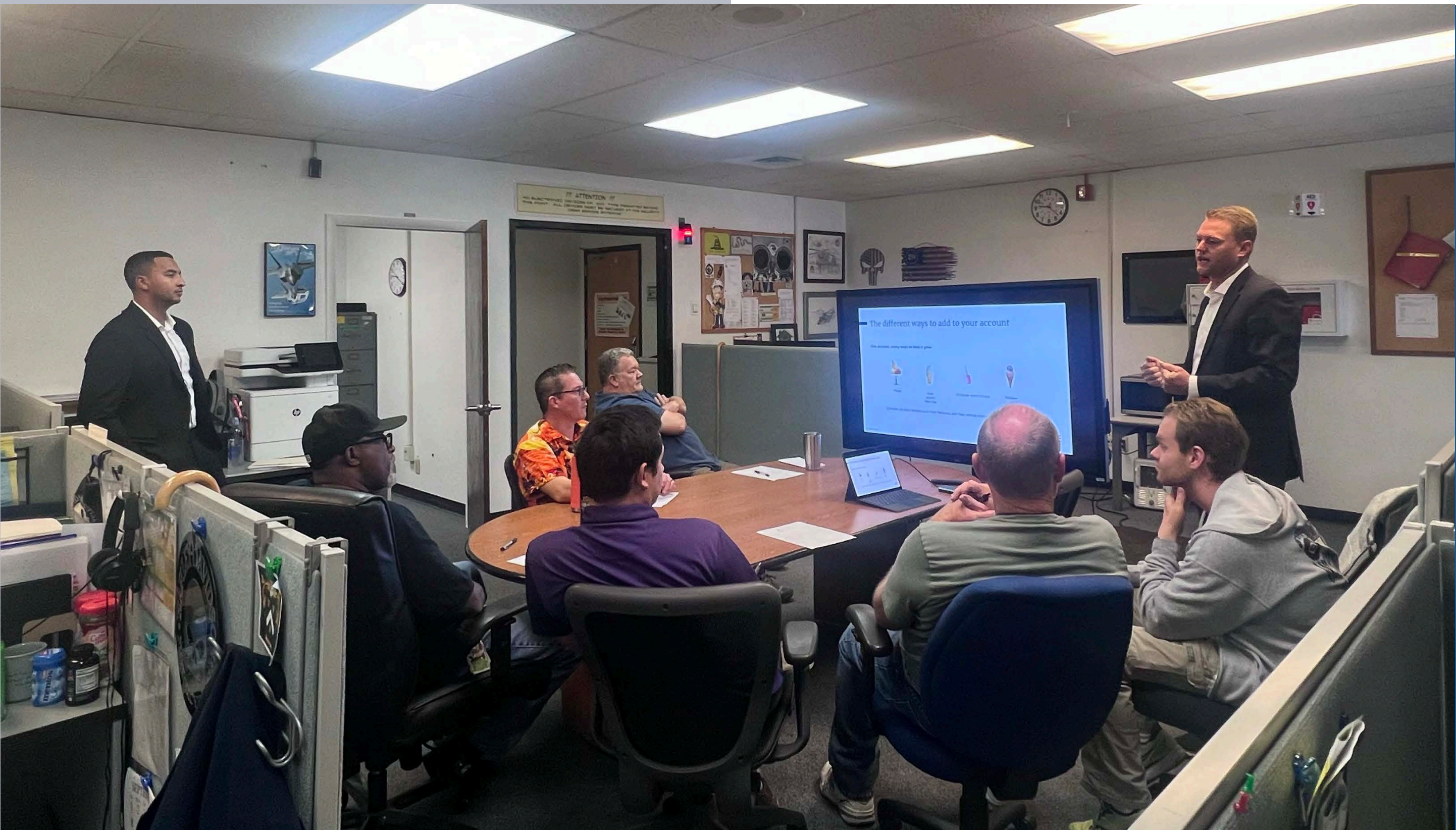
Hill Air Force Base