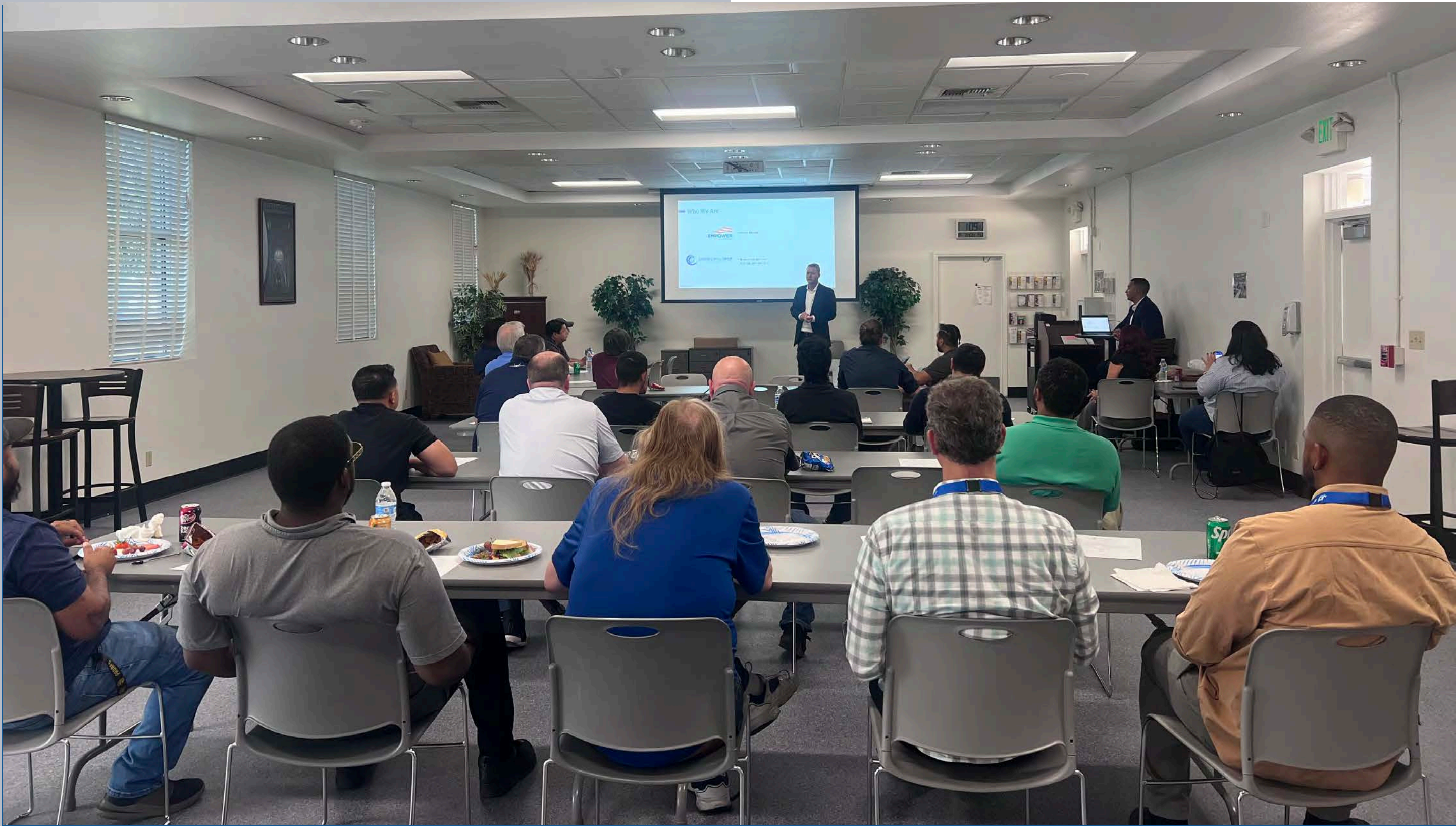
Edwards Air Force Base